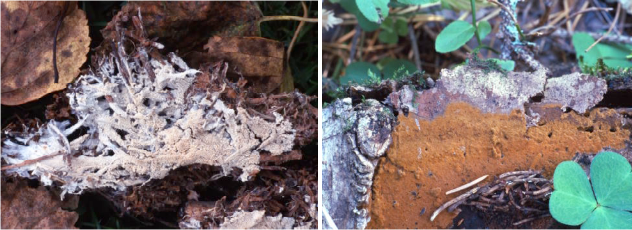
Figure 1. Trechispora kavinioides (left) and Tomentella bryophilila (right), two of the species in Cortbase.

more than a convenient label for an assemblage of similar life forms.